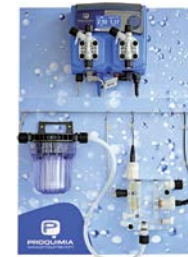
Clorimatic Aljibe Cloro-pH