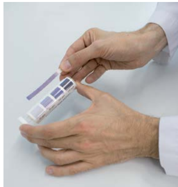
Test of chlorine analysis

In addition, Proquimia has its own microbiological and water analysis laboratory, approved by the "Generalitat de Catalunya" with the Register R7-189-04. This laboratory is available to those clients who wish to carry out specific tests..