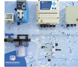
Clorimatic Aljibe Cloro